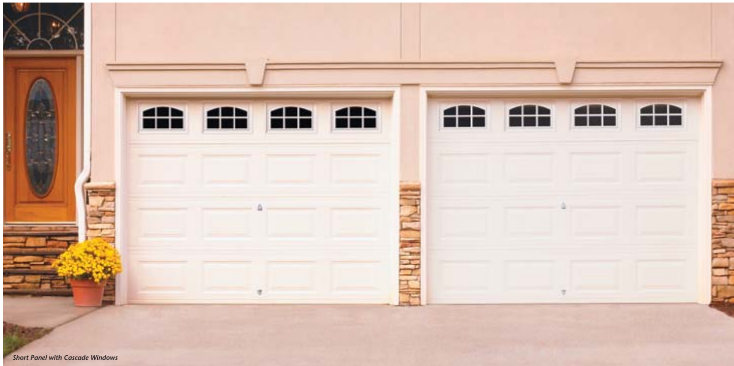
Short Panel with Cascade Windows

When it comes to ultimate protection, the Olympus stands tall. With triple-layer construction, a thermal seal, and superior insulation R-value of 15.67 or 11.04, these durable, low-maintenance doors give you the ultimate in quiet operation and energy efficiency.